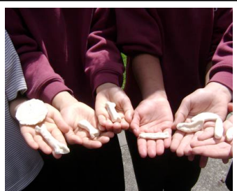
Fossils made from salt dough.