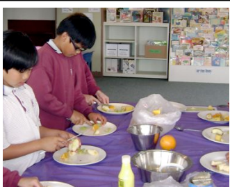
We followed our recipe instructions.